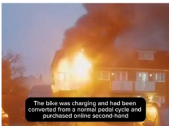
The bike was charging and had been converted from a normal pedal cycle and purchased online second-hand