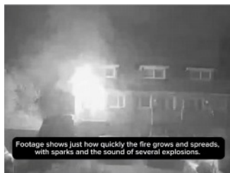
Footage shows just how quickly the fire grows and spreads, with sparks and the sound of several explosions.