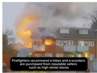
Firefighters recommend e-bikes and e-scooters are purchased from reputable sellers such as high street stores

This does not have to happen in Woodchurch for us all to learn and be aware.