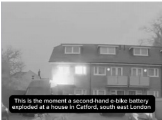
This is the moment a second-hand e-bike battery exploded at a house in Catford, south east London

There is a fire risk when e-scooters and or e-bikes are being charged, and that risk increases if you are using a cheap substandard charger. I carry out this sort of work because I do not want to keep you crime free and then you suffer a disaster of a fire.